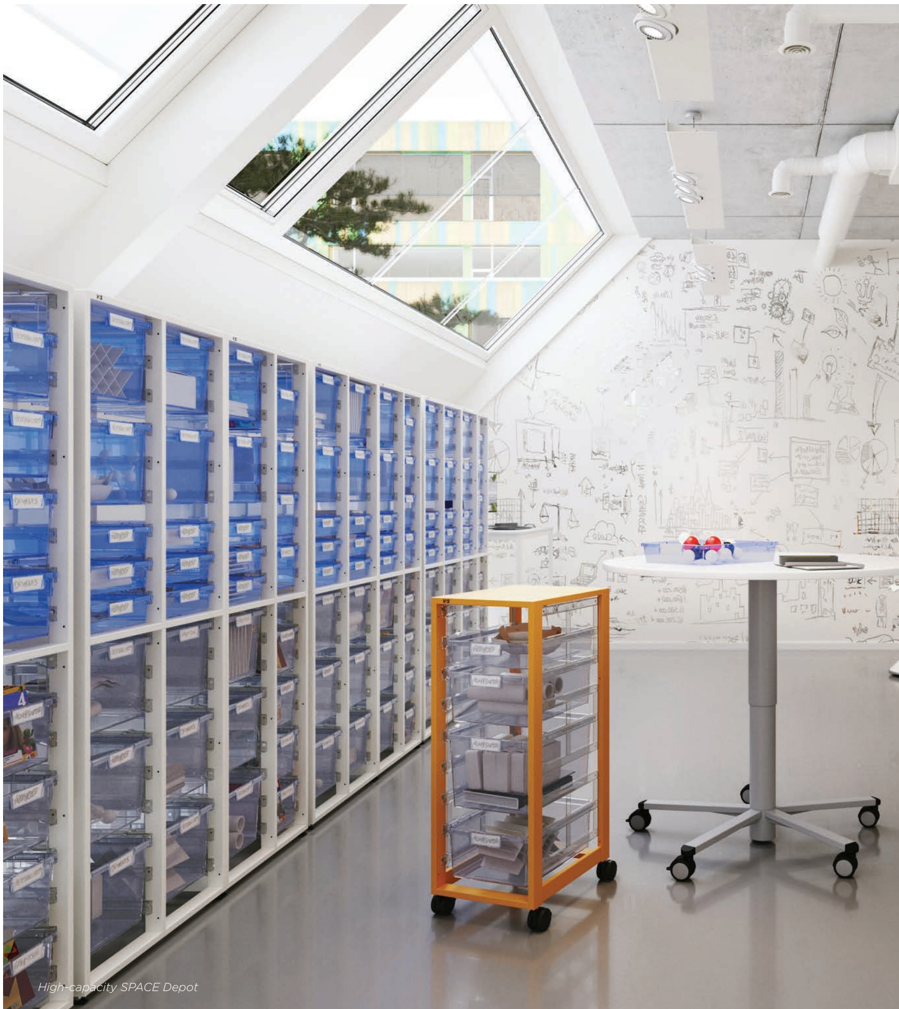
High-capacity SPACE Depot